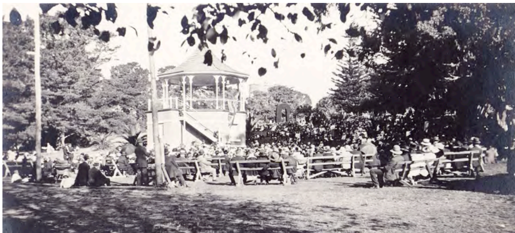
Photo taken in 1920